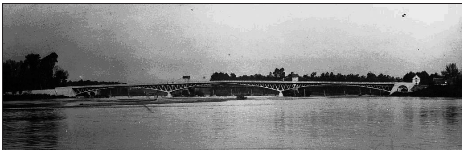
Fig. 2: Veudre bridge

He continued to build shell roofs (his final total came to about 1 km square) culminating in the airship hangars at Orly. His bridges progressively established records for spans with