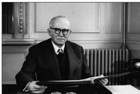
Fig. 1: Eugène Freyssinet

At Moulins, his job was to advise a number of local rural mayors. He loved