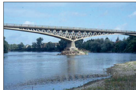
Fig. 3: Boutiron bridge

This period included the construction of between 7 and 8 ha of concrete shell